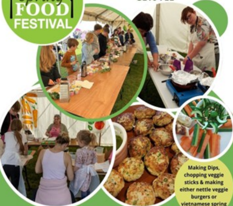
Making Dips, chopping veggie sticks & making either nettle veggie burgers or vietnamese spring rolls